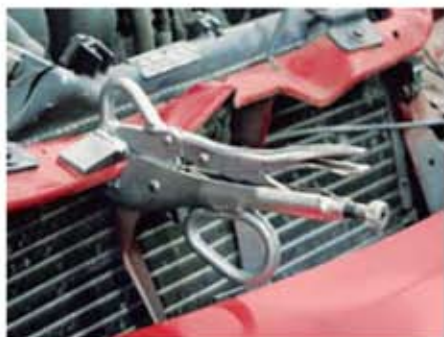
Radiator Support Panels