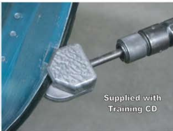
Supplied with Training CD

SDDSZ #21890 DOOR SKIN ZIPPER #21891 REPLACEMENT HEAD